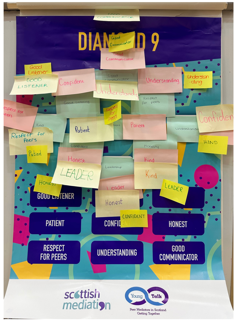
Most important qualities of a peer mediator as identified by high schoolers

'Peer mediation has supported younger pupils to resolve conflicts more effectively - we hope this will reduce bullving issues and fall outs in our school (we are evidencing this just now). Guidance teachers already feel a slight weight off their shoulders with mediators being able to resolve minor disputes, which in itself reduces situations escalating. The training given by Scottish Mediation Service ensured our pupils felt confident in their ability to hold mediations, as well as giving them improved communication skills for everyday life.' (Fife High School Teacher)