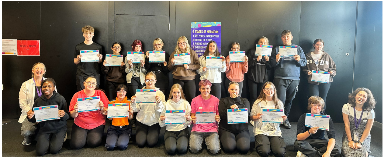
Peer Mediators from Levenmouth Academy with their Peer Mediation certificates

Peer mediation is a process by which children and young people help their peers deal with difficult situations in a constructive, non-violent way. This process involves two trained mediators leading those in conflict through a five stage mediation process to help them come to an agreement. Appropriate situations can include fights in the playground, rumour-spreading, or different types of bullying behaviour. During peer mediation, disagreements are faced and shared understandings are worked toward through careful exploration of the situation.