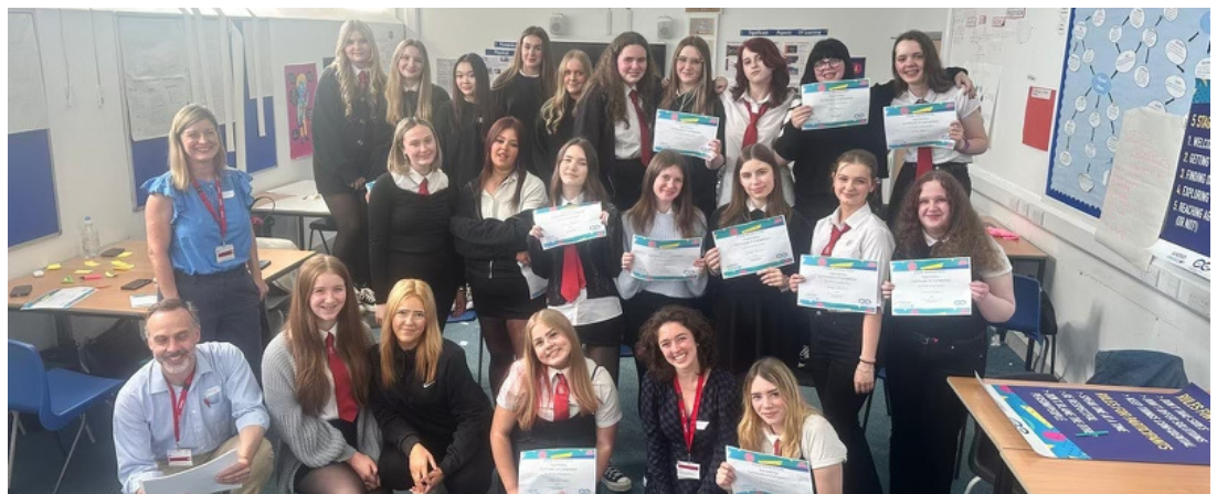
Peer Mediators from Balwearie High School display their peer mediation certificates after completing training

Scottish Mediation (SM) was commissioned by Our Minds Matter Fife to deliver peer mediation training across Fife from October 2021 until January 2023. Within this time, SM offered peer mediation training to every primary school in Fife, reaching over 100 schools and 800 pupils. Due to this success, the programme was extended to 2024 to offer peer mediation training to all 18 high schools across Fife and provide further training to all primary schools—see Appendix 1 for a map of Fife schools.