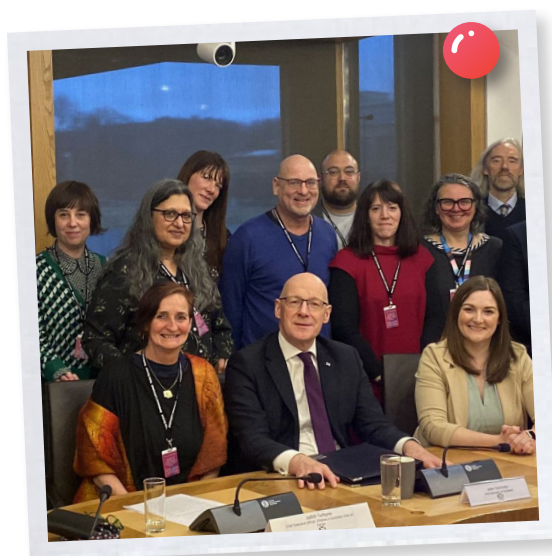
First Minister John Swinney had a lively discussion about children's rights and child poverty with the Children's Sector Strategic and Policy Forum, December 2024