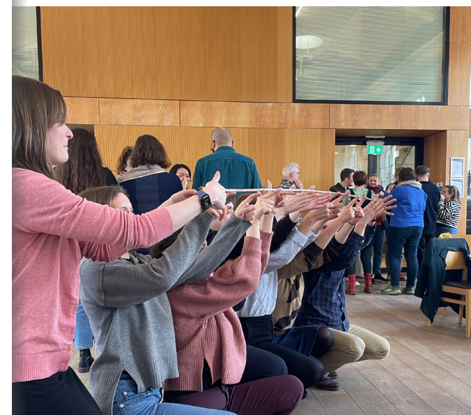
Above: All-staff meetings in Edinburgh, June 2023 and March 2024