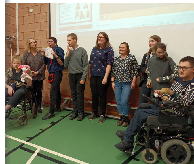
Above: Staff and pupils at Our Lady and St Patrick's High School, Dumbarton (top), and Fairview School, Perth, receiving a Success Looks Different Award