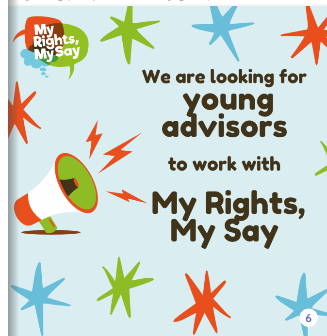
Below: My Rights, My Say formed its young people's advisory group in 2023