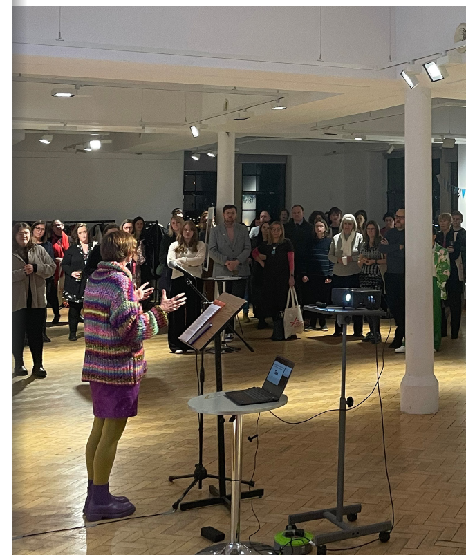
Above: We continue to provide our large and diverse Membership of organisations and individuals with important networking opportunities