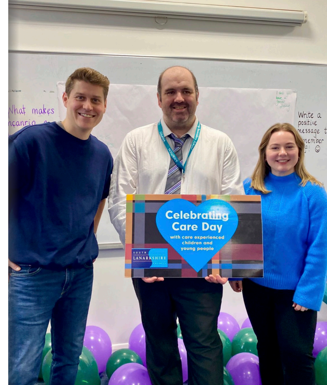
Above: Children in Scotland visit Duncanrig Secondary School to celebrate their Care Day