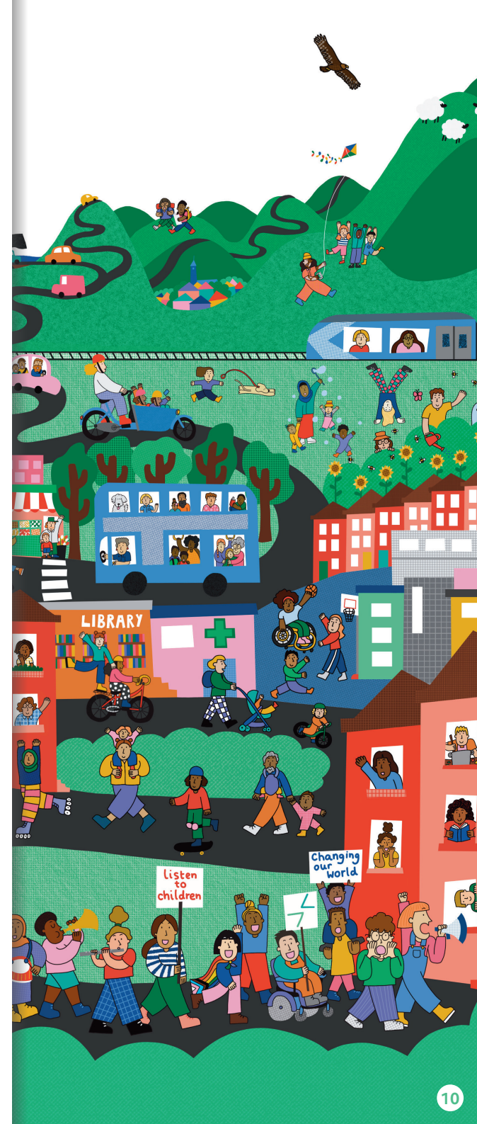
Illustration: Issey Medd

Right: To celebrate our 30th anniversary, we published a commemorative publication, reflecting on three decades of success and change.