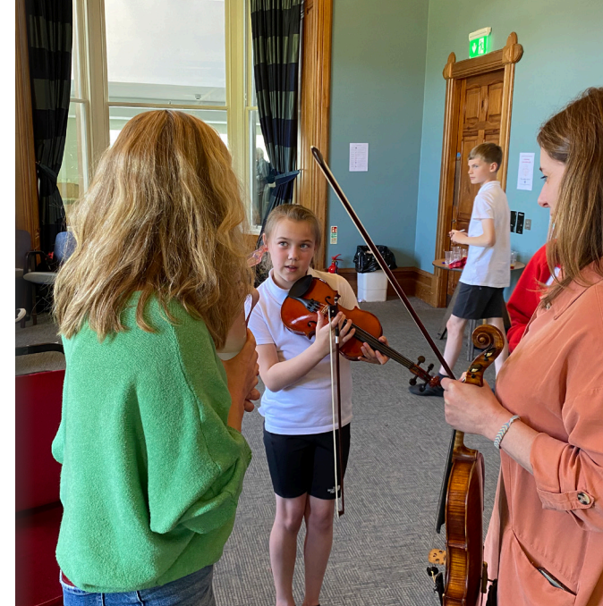
Above: The Live Music and Mental Health project engaged with young people in Inverness, Stirling and Glasgow

We have also started the vital process of setting up our young people's advisory group for the My Rights, My Say service. This work has already been inspiring and we are excited to see how the group continues to develop.