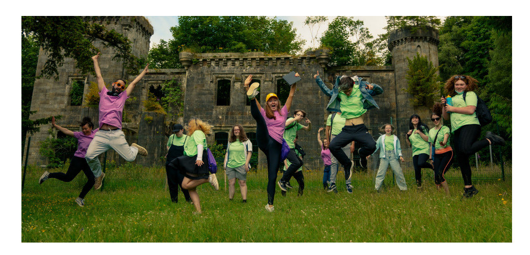
Toonspeak Protest Lab Mugdock Country Park Summer 2021

Young people working with Toonspeak submitted a series of six poems, films and spoken word pieces to the Generation Change: Young People's Participation in Protest exhibition. This document shares the work submitted and shared in the exhibition.