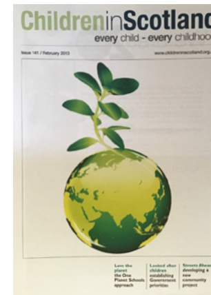
Issue 141 February 2013