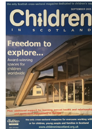
Issue 52 September 2005