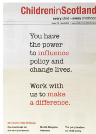
Issue 173 April 2016

Shelter Scotland expose the effects of the Bedroom Tax in a new opinion slot; Jeni Bainbridge talks transition issues; and we cover the Stage 1 draft of the Children and Young People Bill, finding 'significant gaps in support... for vulnerable children'.