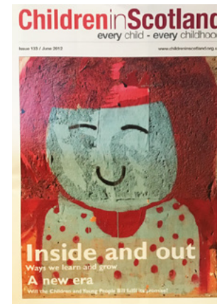
Issue 133 June 2012