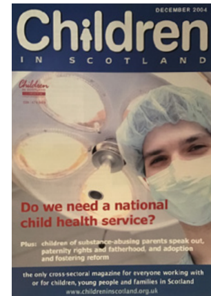
Issue 43 December 2004