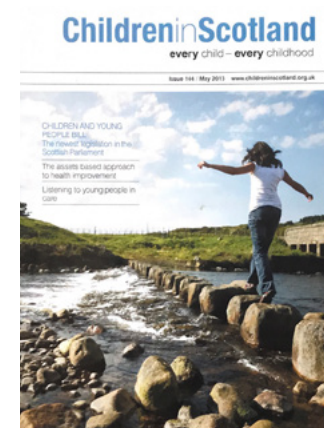
Issue 144 May 2013