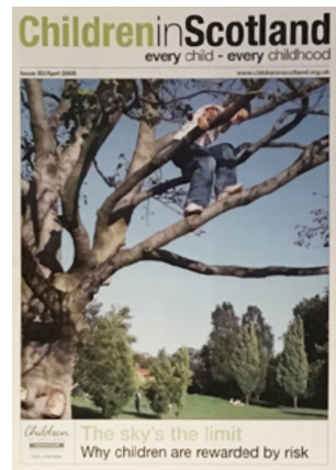
Issue 82 April 2008