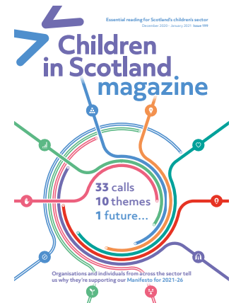
Issue 199 December 2020

An explosive seasonal cover marking 30 years of the UNCRC. Contributors explain how, from child protection to participation, enhanced rights enhance lives – and look forward to Scottish Government-promised 'maximum incorporation'.