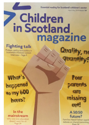
Issue 185 April 2018