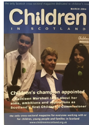
Issue 34 March 2004