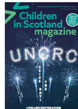
Issue 194 October 2019