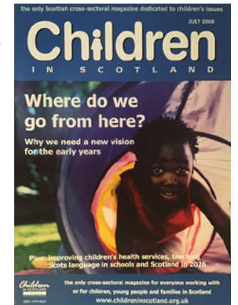
Issue 62 July 2006