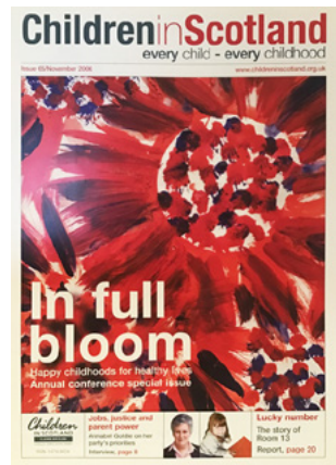
Issue 65 November 2006

We cover the launch of our 2007-11 Manifesto prioritising entitlement to free, nutritious school meals for all primary children, and Caroline Dunmur reports on the Access all Areas project which captures young people's views on school accessibility.