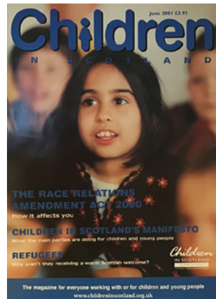
Issue 1 June 2001

From refugee rights to Brexit and climate strikes, a snapshot of how our magazine has evolved visually and editorially over 200 issues