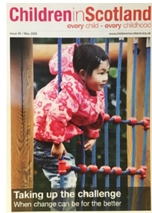
Issue 95 May 2009