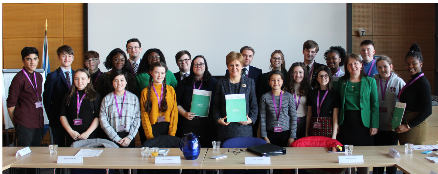
Children and young people (including members of the Panel) meeting with the First Minister and the Minister for Children and Young People